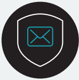
Advanced Email Protection