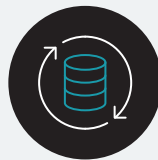
Data Backup and Recovery