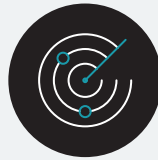
Cyber Threat Management