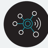
Endpoint Detection and Response